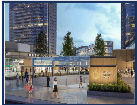
King George Hub Ledcor Group