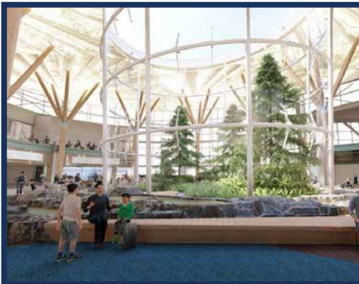
YVR Pier D Expansion PCL Construction