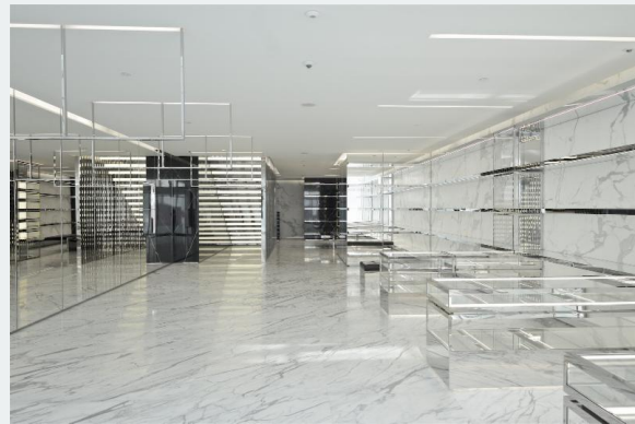
Retail Sales Area