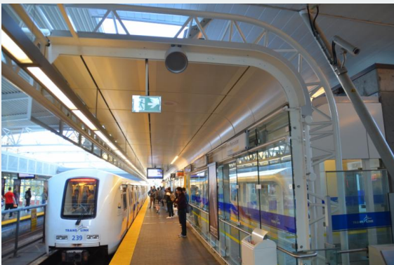
Curved Ceiling at Platform Level