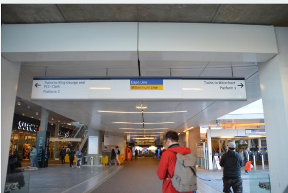
Convex Ceiling at Concourse Level

The New West Skytrain upgrade consisted of extensive custom metal ceilings, intricate details with curved ceilings and large convex ceiling at the concourse level. The main challenge of this project was maintaining public safety and working around Translink schedules.